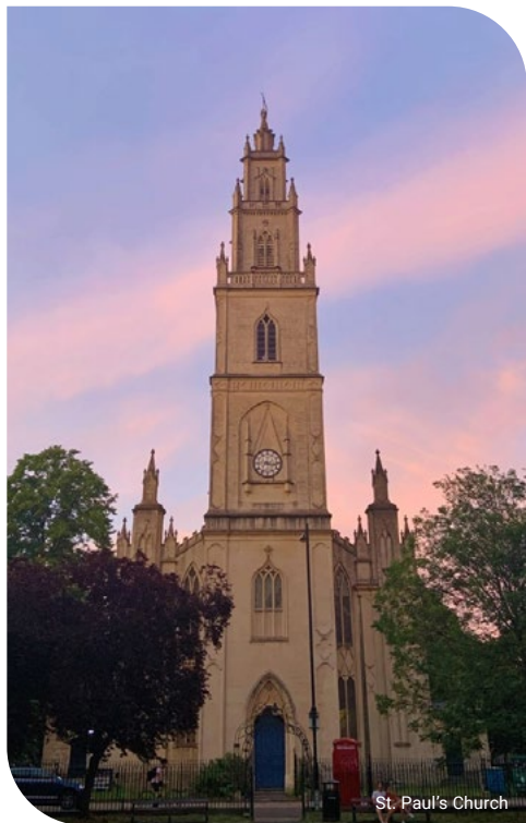
St. Paul's Church