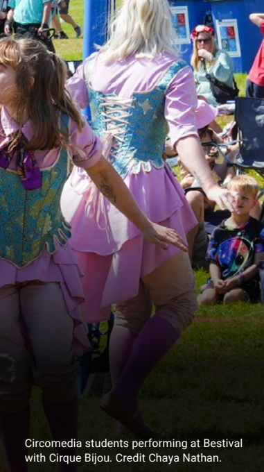
Circomedia students performing at Bestival with Cirque Bijou.