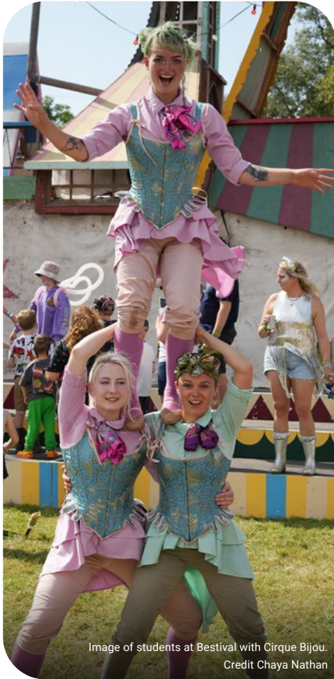
Image of students at Bestival with Cirque Bijou.