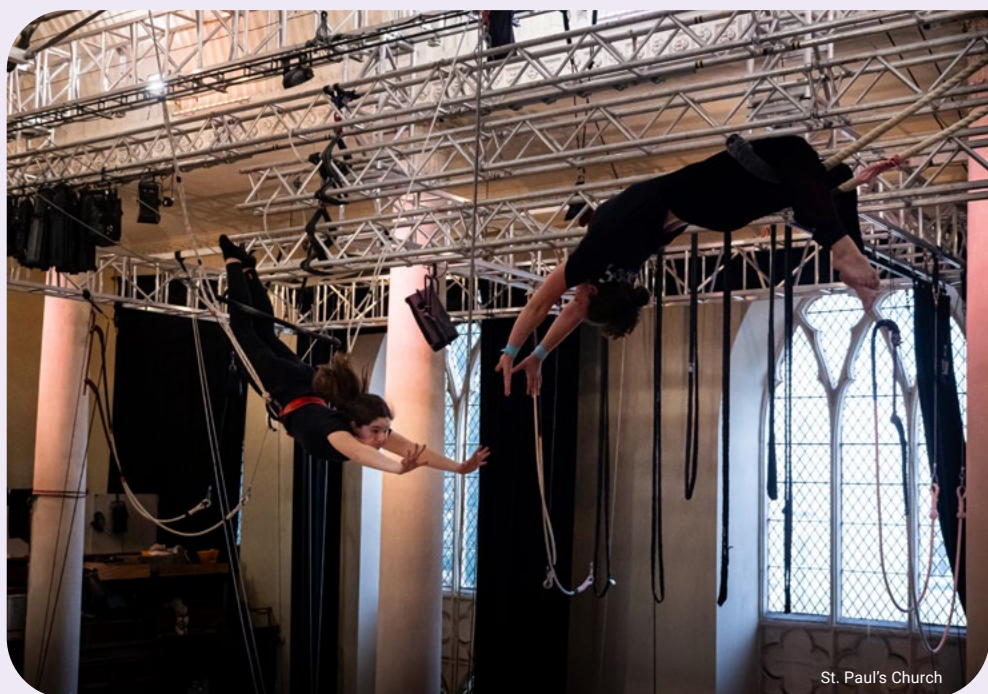
St. Paul's Church