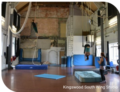
Kingswood South Wing Studio

Our BTEC students are based in the city centre, and spend one day a week at Kingswood. Our higher education and master's degree students spend most of their time at Kingswood, where many of our teaching, academic and office staff are also based.