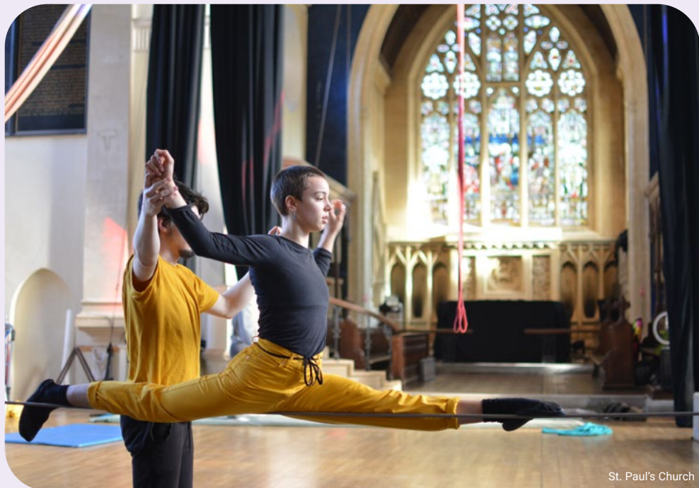
St. Paul's Church